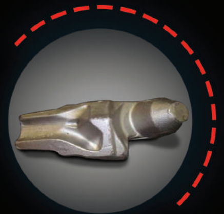
Jet Arm, Tri-cone, Drill Bit