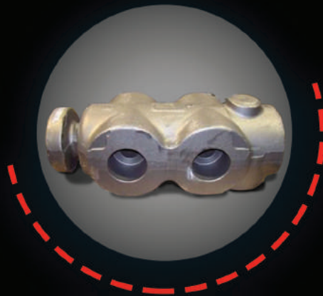
3-15M, Body, Dual Valve