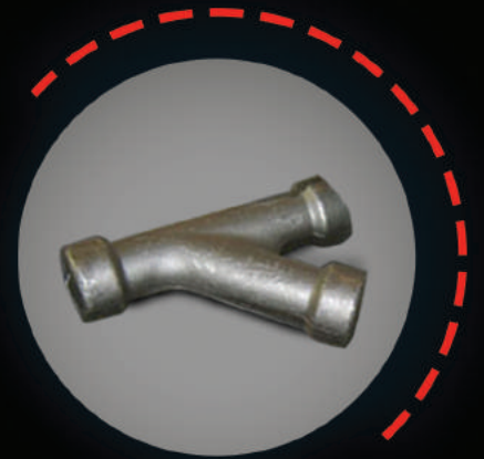
Frac Pump Flow Component