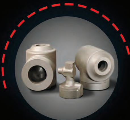
U.S. Navy, Nickel Base Alloy and Stainless Steel Valve Bodies