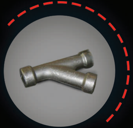
Frac Pump Flow Component