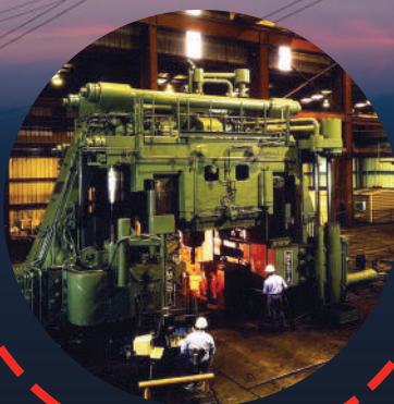
11,000 Ton Multi-Ram Press