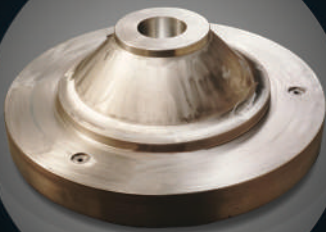
Compressor End Cap

GENERATOR-SETS, INDUSTRIAL GAS TURBINES, NUCLEAR & WIND