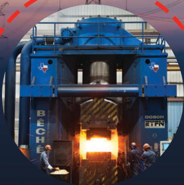
80 Meter Ton Counter Blow Hammer